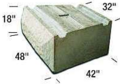
Full Boulder 48" x 18" x 42" (32") Weight: 2050 lbs. Sq. Ft. / Block: 6 sq. ft.